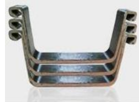
STEEL SHEET PILE